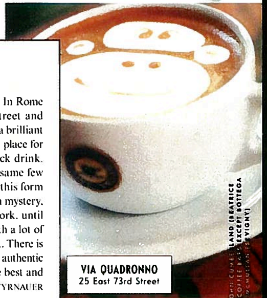
VIA QUADRONNO 25 East 73rd Street