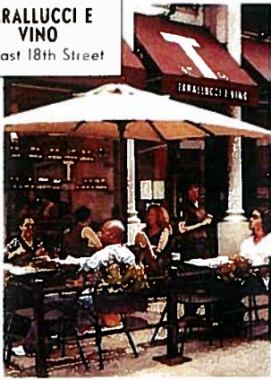
TARALLUCCI E VINO 15 East 18th Street