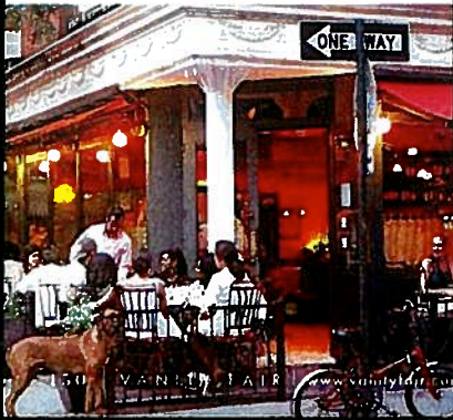
SANT AMBROEUS 259 West 4th Street